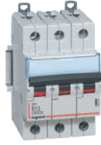
4 088 90